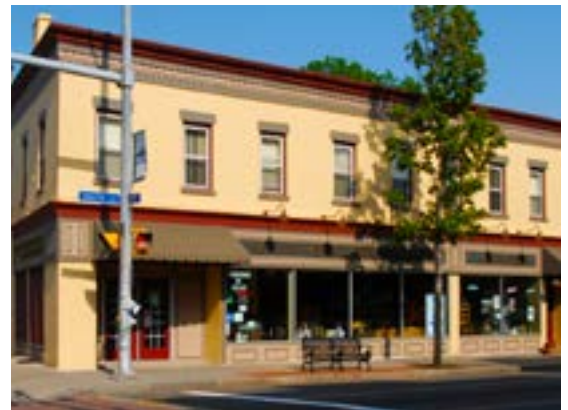
Over 3,000 square feet of retail space at the intersection of South Avenue and Gregory Street in the South Wedge.

75 Thruway Park Drive West Henrietta, NY 14586