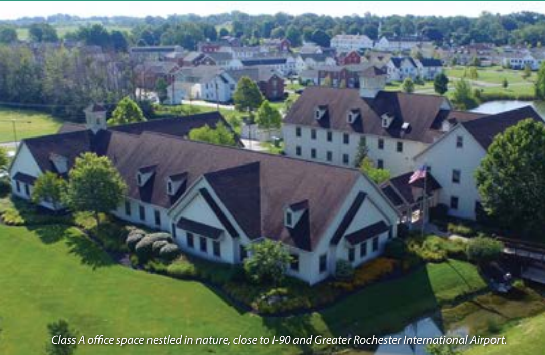
Class A office space nestled in nature, close to I-90 and Greater Rochester International Airport.

LECESSE Construction's merger with The Pike Company moves them downtown, opening two premium office spaces for lease.